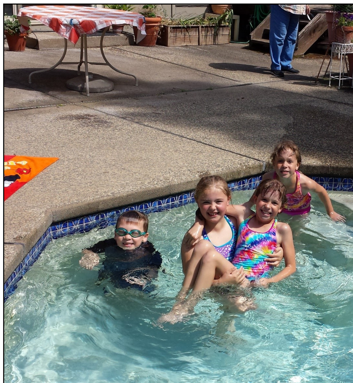
Kids have all the fun!