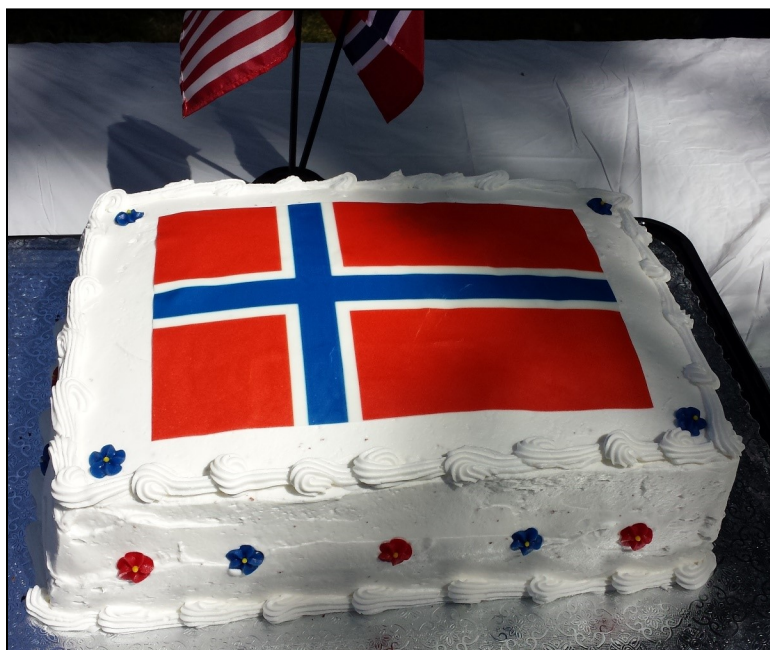
Beautiful cake, Donna!